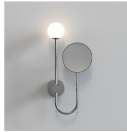
CODE: 1424001 FINISH: POLISHED CHROME