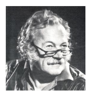
Angelo Brotto Design, 1959